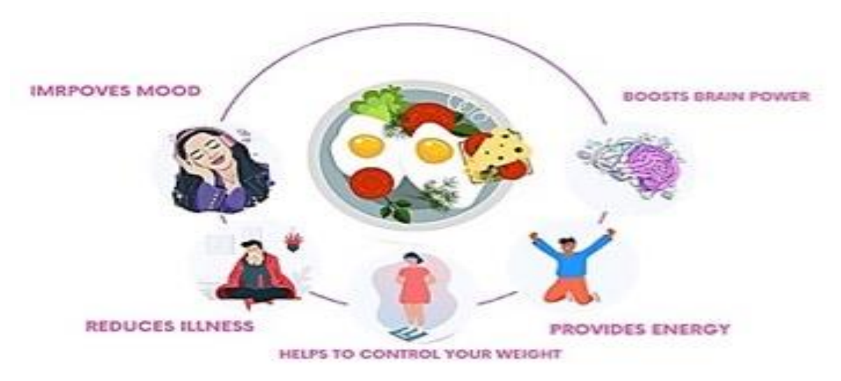
Figure 1: Benefits of eating breakfast. Eating breakfast offers numerous benefits for overall health and well-being. It can enhance mood, boost cognitive function, and reduce the risk of illnesses. A balanced breakfast provides essential energy for daily activities and can aid in weight management by curbing unhealthy snacking later in the day. Establishing a regular breakfast routine can contribute to a healthier and more productive lifestyle

The social norms, psychological aspects, and knowledge about breakfast in a culture are important and the scientific community should emphasize it more. [10] Breakfast consumption is essential to maintain a healthy body. It maintains a healthy weight, reduces insulin sensitivity, and lowers the likelihood of developing a number of diseases, including type 2