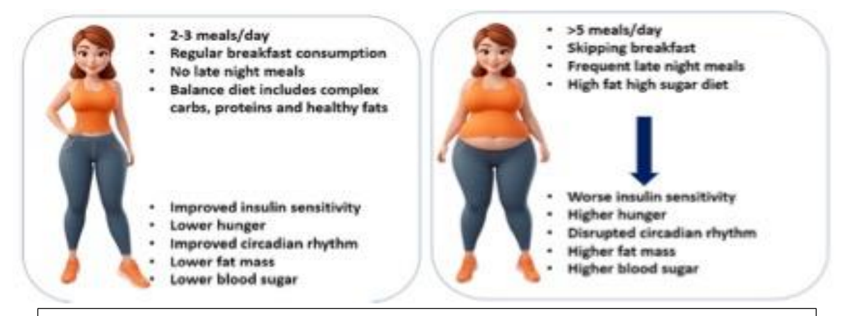
Figure 3: Effect of meal timings on different variables Incorporating a dietary routine of 2-3 well-balanced meals a day, with a consistent emphasis on consuming a regular breakfast and avoiding late-night meals, can yield numerous health benefits. This approach has been shown to significantly improve insulin sensitivity, reducing the risk of diabetes, and lower overall hunger levels, aiding in weight management. Additionally, it supports a healthier circadian rhythm, enhancing sleep quality and overall well-being. This dietary pattern is associated with lower fat mass and more stable blood sugar levels, promoting overall metabolic health.

breakfast intake and a reduced risk of various metabolic conditions, suggesting that regular breakfast consumption may have a protective effect on metabolic health.[45].