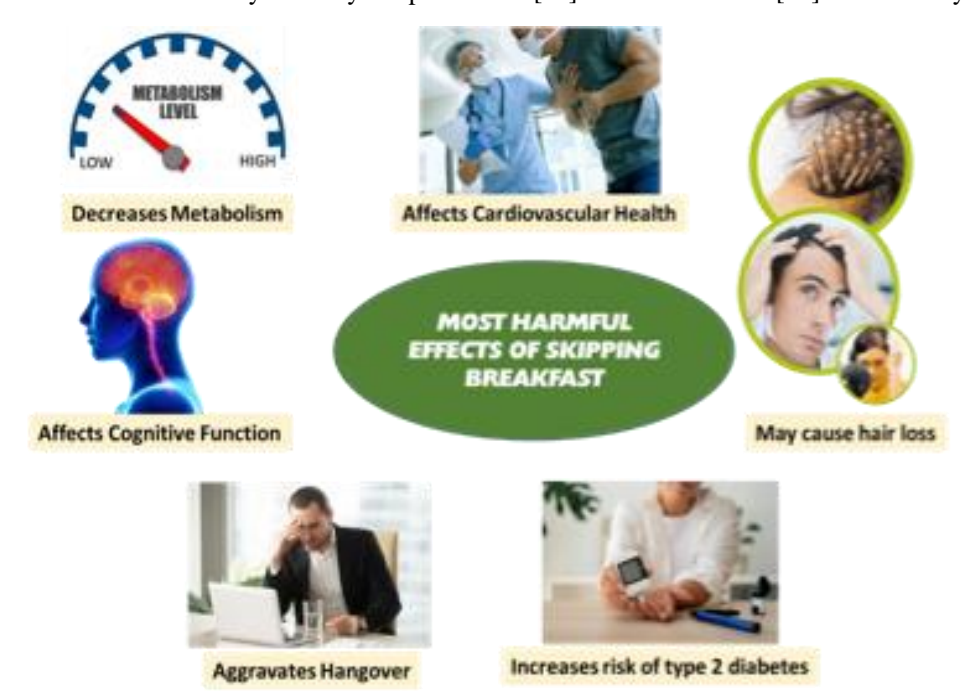
Figure 2: Harmful effects of skipping breakfast. Skipping breakfast can have many harmful effects on the body. It can lead to decreased metabolism, potentially contributing to weight gain. Additionally it may affect cardiovascular health, Cognitive function, and even lead to hair loss. Skipping breakfast can also worsen the symptoms of a hangover and increased the risk of developing type 2 diabetes. Therefore maintaining a healthy breakfast routine is essential for overall well-being.

[28]. In a recent report, about 36% of the UK population lipoprotein cholesterol (HDL-C) in their either eat occasionally or always skip breakfast [29]. bloodstream.[36] Additionally, research has indicated